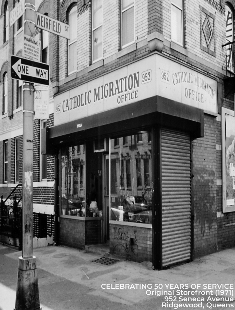
CELEBRATING 50 YEARS OF SERVICE Original Storefront (1971) 952 Seneca Avenue Ridgewood, Queens